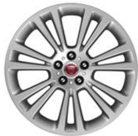
19" Style 7013, 7 split-spoke, Silver