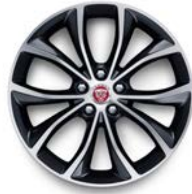
18" Style 5033, 5 split-spoke, Contrast Diamond Turned finish