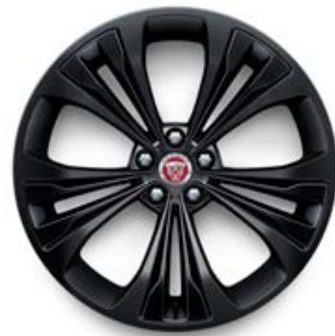
20" Style 5107, 5 split-spoke, Satin Black with Gloss Black inserts