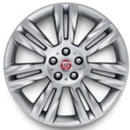
18" Style 7011, 7 split-spoke, Silver