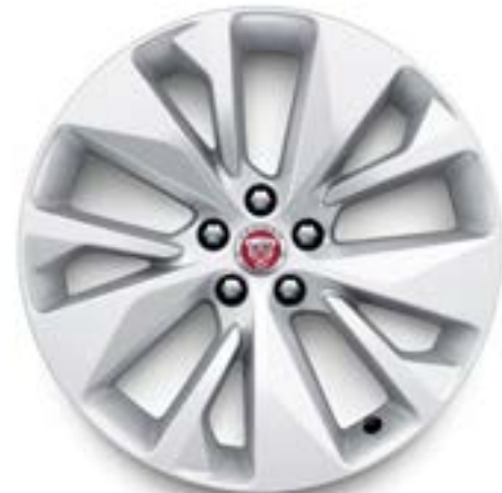
19" Style 5106, 5 split-spoke, Silver