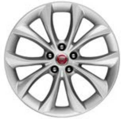
18" Style 5033, 5 split-spoke, Silver

Personalize your vehicle with a selection of alloy wheels featuring a wide range of contemporary and dynamic designs.