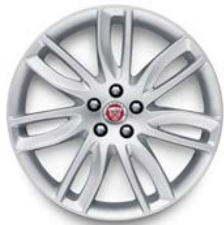
19" Style 7012, 7 split-spoke, Silver

Personalize your vehicle with a selection of alloy wheels featuring a wide range of contemporary and dynamic designs.