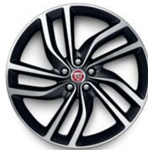
20" Style 5036, 5 split-spoke, Satin Dark Grey Diamond Turned finish