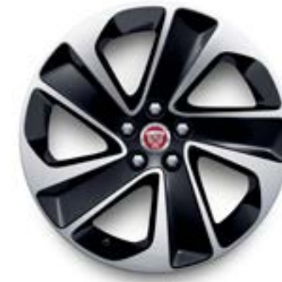
18" Style 5105, 5 spoke, Dark Grey Diamond Turned finish