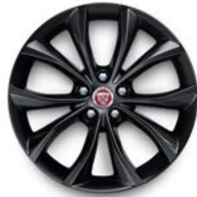
18" Style 5033, 5 split-spoke, Gloss Black