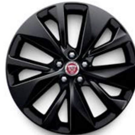
19" Style 5106, 5 split-spoke, Gloss Black