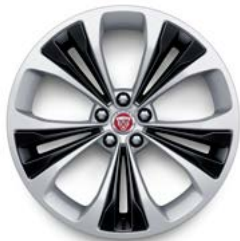
20" Style 5107, 5 split-spoke, Silver with Gloss Black Inserts