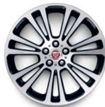
19" Style 7013, 7 split-spoke, Contrast Diamond Turned finish