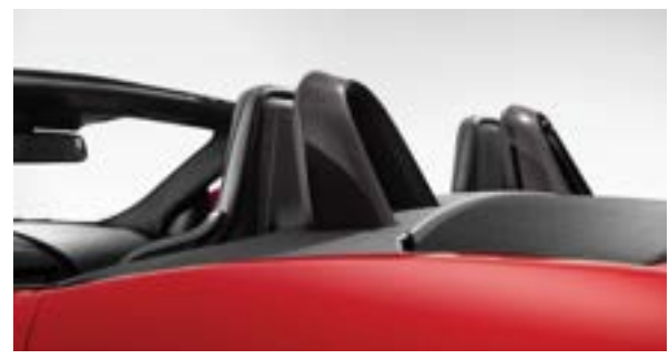
Carbon Fibre Roll Hoops $1,890

High grade Carbon Fibre roll hoops featuring a 2x2 twill weave and a High Gloss lacquered finish provide a performance-inspired styling enhancement coupled with weight benefits associated with carbon fibre.