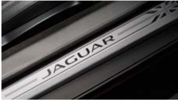
Sill Treadplates - Union Jack

Elegantly styled stainless steel sill treadplate finisher for driver or passenger doors. Illuminates when either the driver or passenger doors are opened. Highlighted by soft phosphor blue lighting.