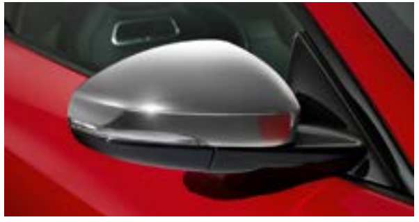
Chrome Mirror Covers

Chrome mirror covers accentuate the stylish design of the exterior mirrors.