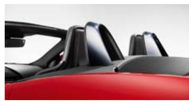
Chrome Roll Hoops

High grade Carbon Fibre roll hoops featuring a 2x2 twill weave and a High Gloss lacquered finish provide a performance-inspired styling enhancement coupled with weight benefits associated with carbon fibre.