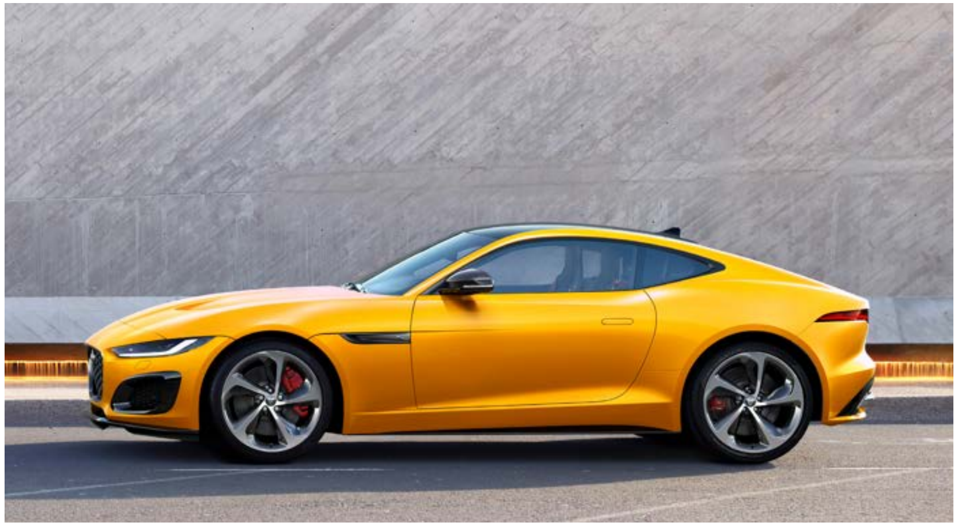
THE ART OF PERFORMANCE