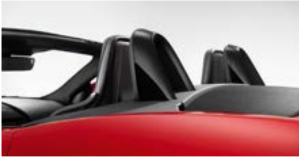
Gloss Black Roll Hoops

Gloss Black roll hoops provide a dynamic exterior styling enhancement.