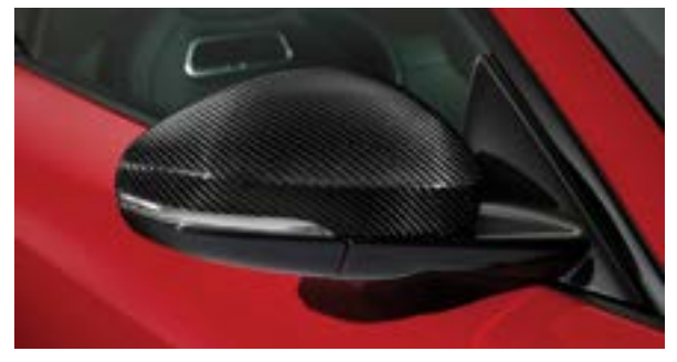
Carbon Fibre Mirror Covers

High grade Carbon Fibre mirror covers provide a performance-inspired styling upgrade.